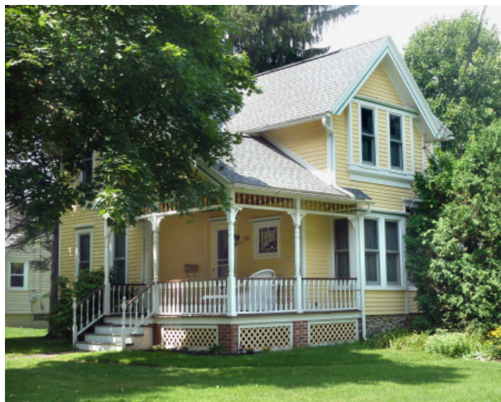
132 Roselawn Avenue

Don't miss an opportunity to tour the Sunflower, the largest English narrow canal boat for charter on the Erie Canal. This packet-style boat has been owned and operated since 2009 by Robin Ward and Gary Ezell through lowbridgecharters.com from its home port of Fairport. She will be docked on the canal between 1:00 and 4:00 p.m., on the west side of the lift bridge. Your house tour ticket will let you see how present-day adventurers can travel the canal in compact, yet comfortable surroundings (no mules needed).