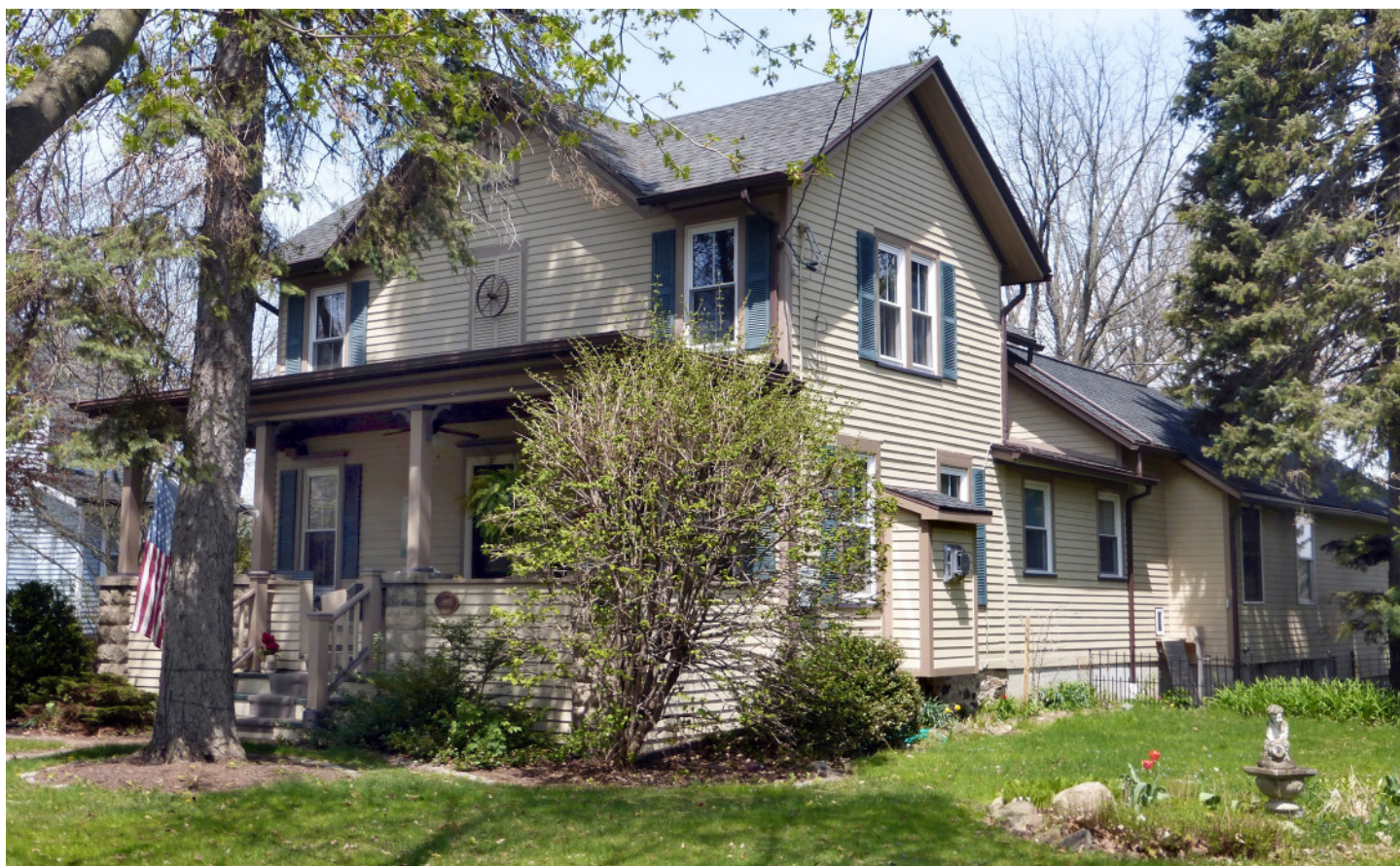
84 Roselawn Avenue, one of the homes on the October 5th tour