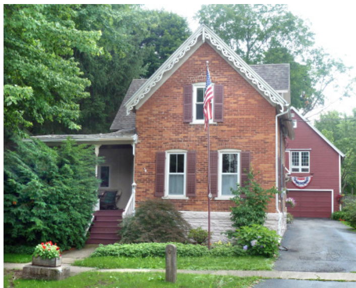
53 Roselawn Avenue

This year's tour takes us to a number of historic homes on Roselawn Avenue in Fairport. As we celebrate the 100th year anniversary of Fairport's lift bridge, we thought it only fitting to showcase some canal-side homes constructed in the late 1800s and early 1900s.