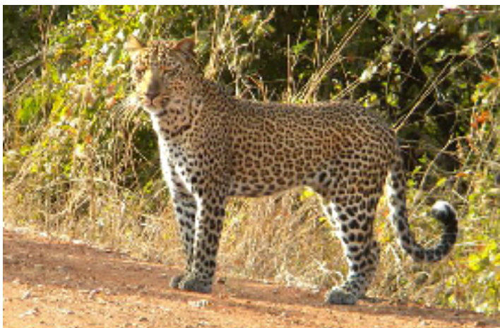
Leopard in Zambia