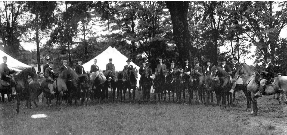
Tuesday's Old Home Week activities included trotting races laid out on a course on Church Street. In the evening, relay horse races started from Webster, Macedon, Pittsford, and East Rochester, with the finish line on Main Street in Fairport.