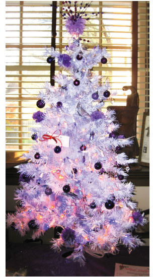
A silent auction item from 2016

Beginning November 21th and ending December 12th, visitors to the museum will have the opportunity to bid on beautiful gift baskets, wreaths and tabletop Christmas trees that have been decorated and donated for silent auctions by members of our community, organizations and businesses. All proceeds from the silent auctions benefit the Perinton Historical Society and support its educational programs and the operation of the museum.