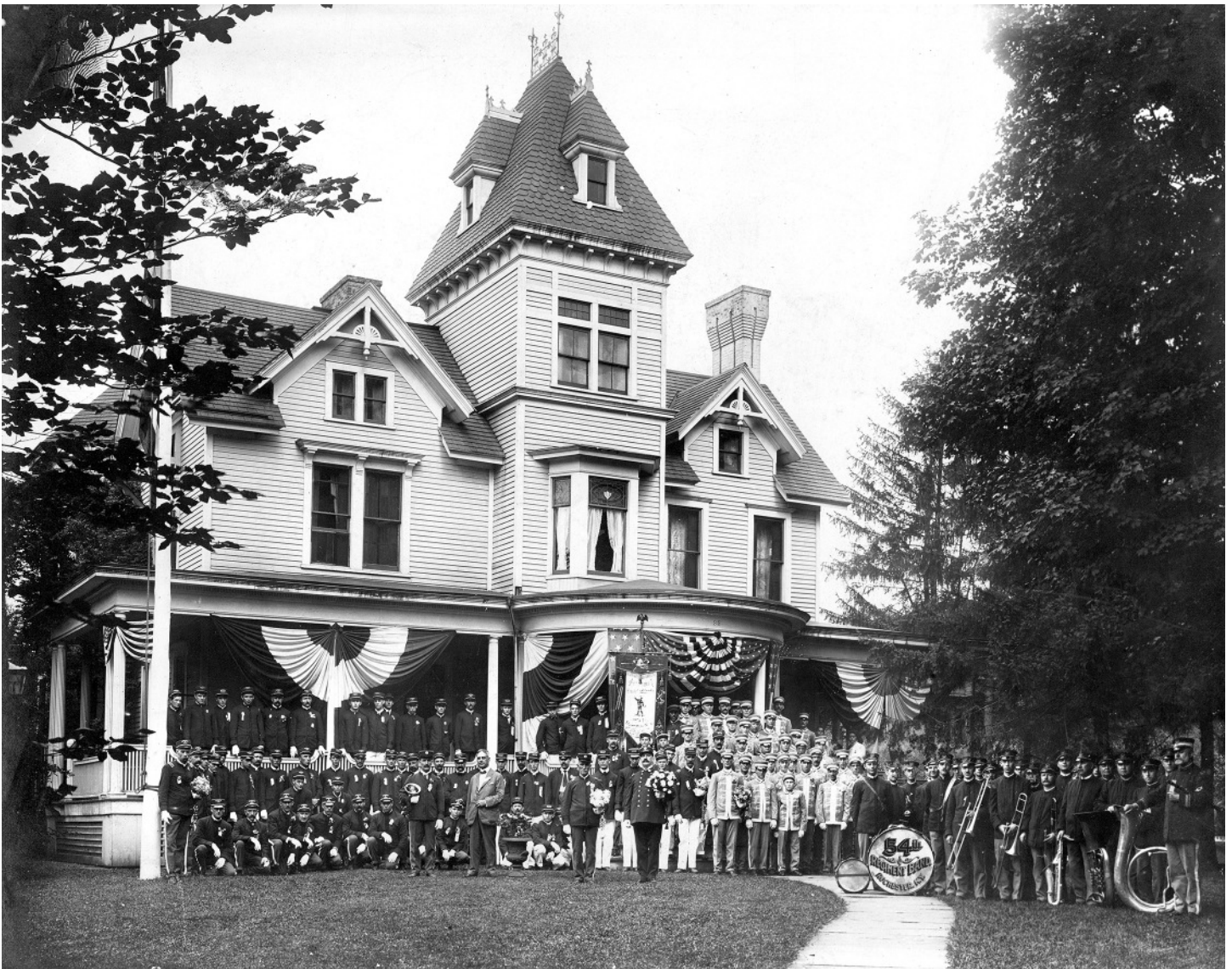
A total of forty fire companies and thirteen bands marched in the Fireman's Parade on Thursday morning of Old Home Week. Here the 54th Regiment Band posed for a photograph in front of the Parce mansion at 137 North Main Street.