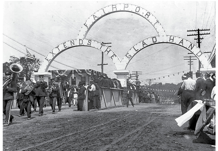
More than one thousand light bulbs illuminated the triple arch over Fairport's old Main Street Bridge, which featured the slogan, "Fairport Extends the Glad Hand."

Even before the celebration began, large crowds gathered during the evening of Saturday August 1st, to witness the lights when they were first turned on. The DeLand Band played several selections from the Town Hall balcony, then marched north, across the bridge, and on to DeLand Park, as thousands of people followed. A good start, considering the week-long celebration did not officially begin until the following morning.