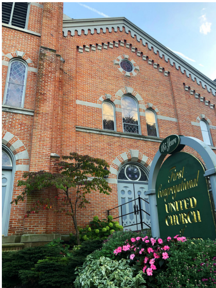
Fairport's First Congregational United Church of Christ, at 26 East Church Street

Built in 1868, this is the oldest church structure in the village.