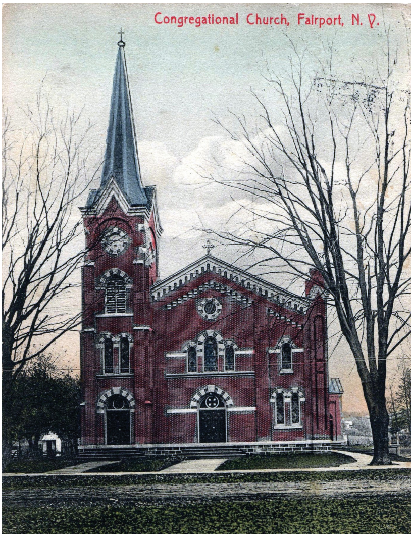
An early 1900s postcard view of Fairport's First Congregational United Church of Christ