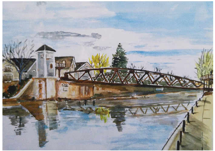
Fairport's historic liftbridge—painting by Rusty Likly

Check the December issue of Historigram for additional special events occurring during our Yuletide Traditions celebration!