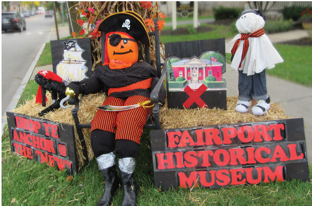
Pirate Pete and his pals promoted the museum's revamped exhibits at this year's popular Fairport Scarecrow Festival.