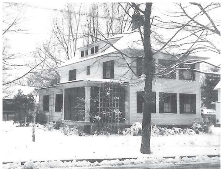
14 West Street, one of the seven houses on the tour, pictured here in 1960

2019 PHS House Tour: West by West by Woodlawn