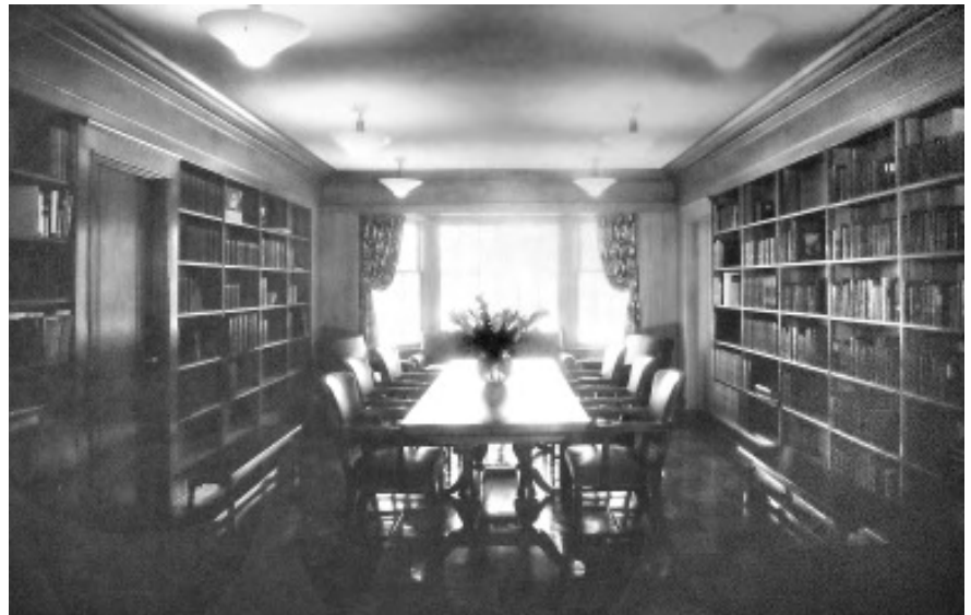
1938 view of the Reference Room, Fairport Public Library. This area is now the gift shop of the Fairport Historical Museum.

Group tours, presentations and special projects are by appointment.