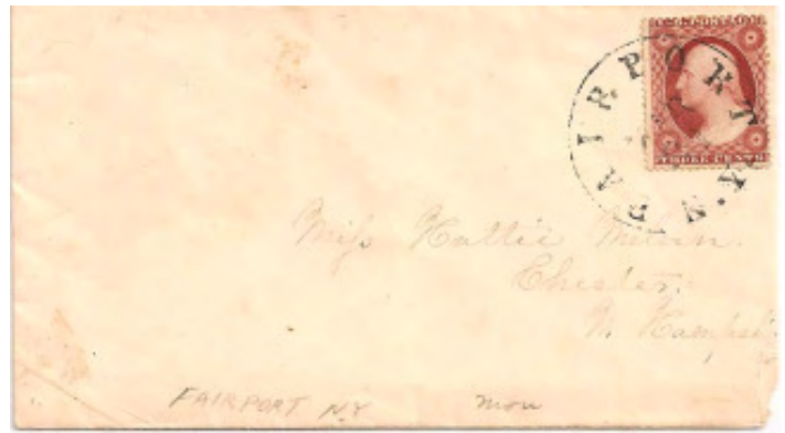
Early envelope hand canceled in Fairport between 1853 and 1861