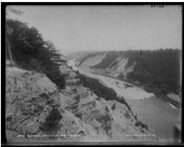
The high bank of the Genesee River near Mt. Morris, NY.

We hope these articles will help the membership and the public appreciate what a truly unique institution we have here in Fairport.